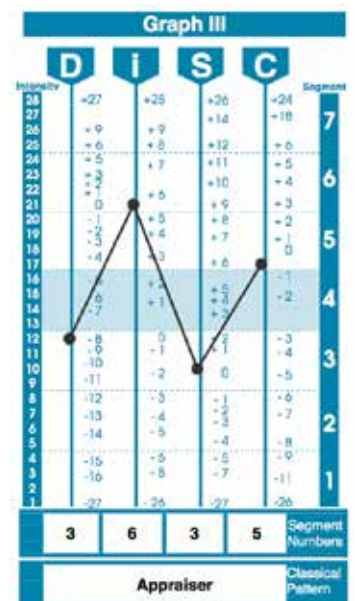
DiSC® Graph Model

STEP 5 Receive your Discovering / Wiley Certificate