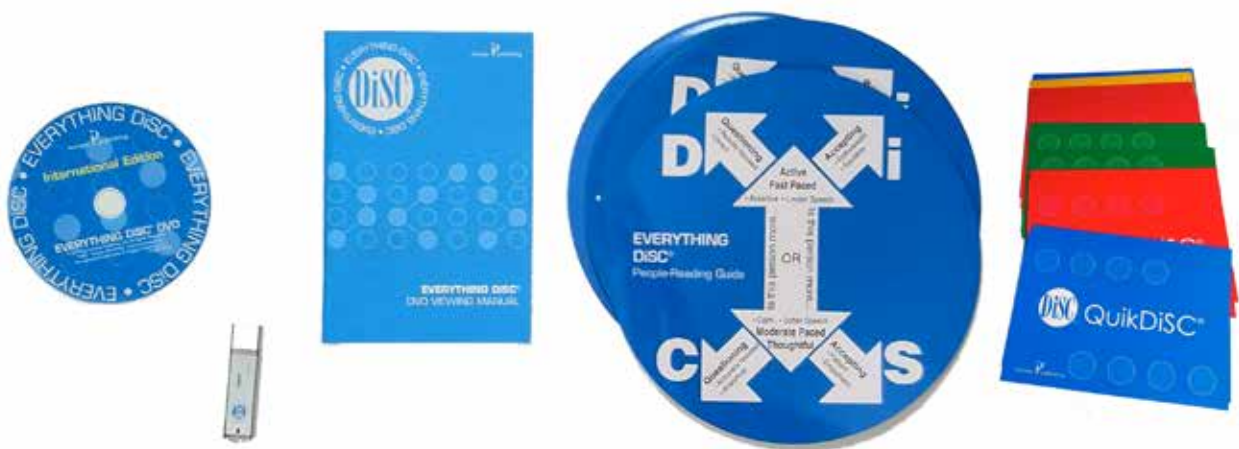
DiSC® Classic Facilitation System 1.5e materials